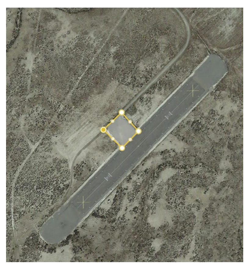
Figure 3-2. Proposed Location to be Paved with Asphalt