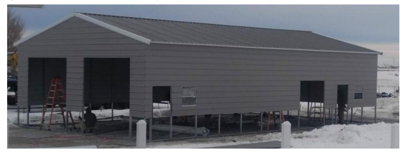
Figure 2-3. Example of the Steel Structure