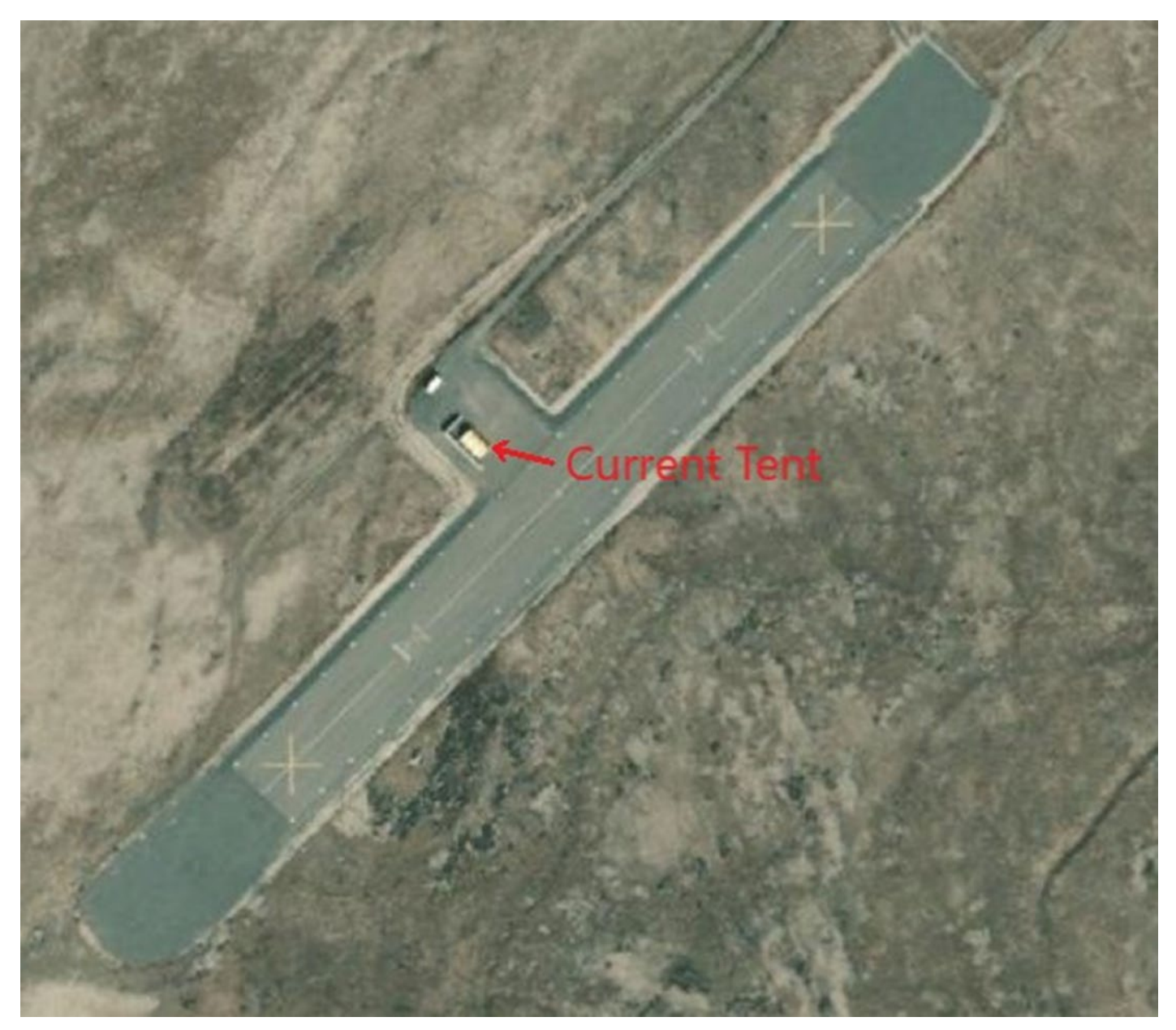
Figure 2-2. Current Location of the Tent at UAS Runway