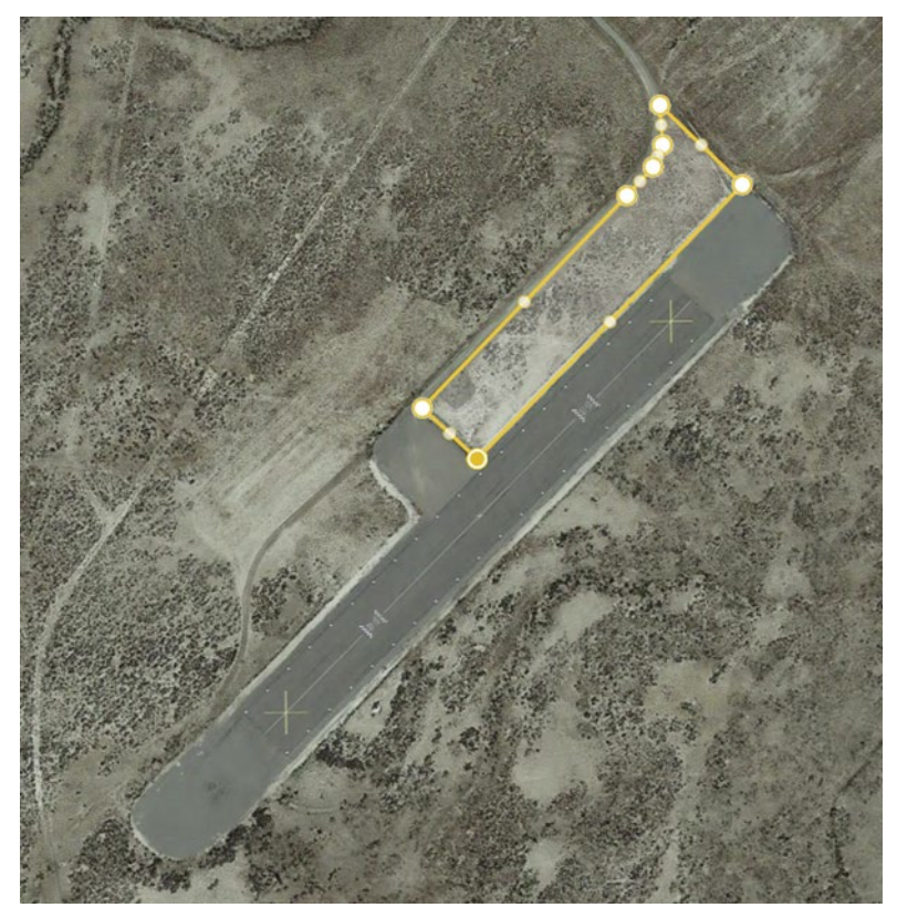
Figure 3-1. Proposed Location of Large Gravel Area

To pave the central gravel pad, a minimum of 3" of asphalt will be placed around B16-612 UAV Metal Shelter on top of existing crushed gravel. The area to be paved is approximately 17,000 square feet minus the footprint of the metal shelter (1500 sq ft). See Figure 3-2 for the proposed location of the area to be paved.