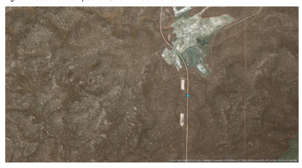
Figure 2. Distance of backup transmitter from nearest lek.