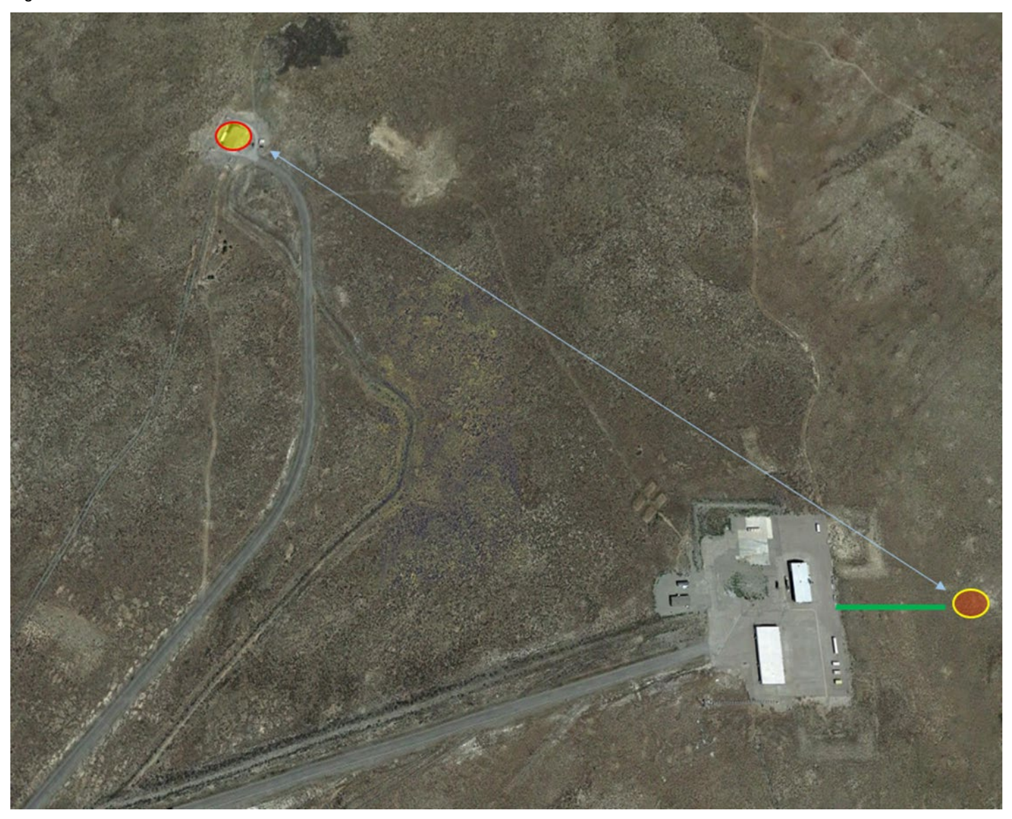
Figure 2-1 Test 1 Test Locations.

The second set of test locations will utilize a site on East Butte and a corresponding site southeast of the Central Facilities Area off the side of Highway 20 near Gate 3. Both are previously disturbed areas. The East Butte location will employ a 25-ft telescoping tower, with a drive-over base, and a small generator. The location near CFA will use a tripod mounted antenna approx. 1 meter tall with a spectrum analyzer.