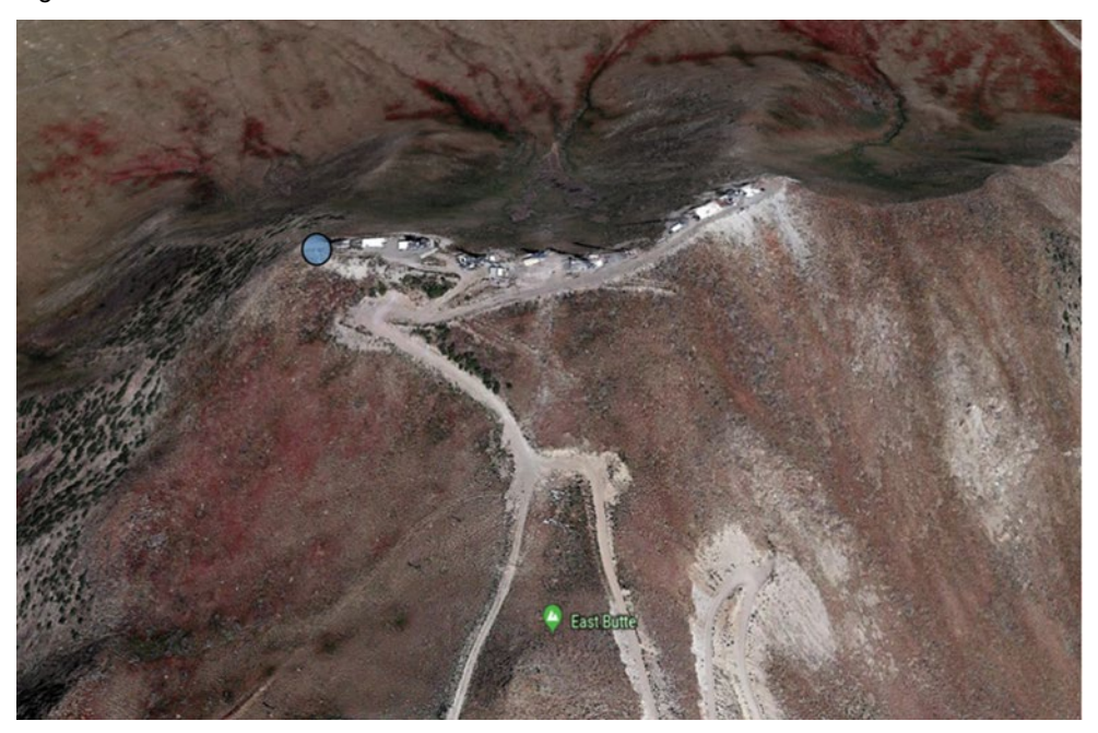
Figure 2-2. East Butte Test Location

The site on East Butte is shown in Figure 2-2.