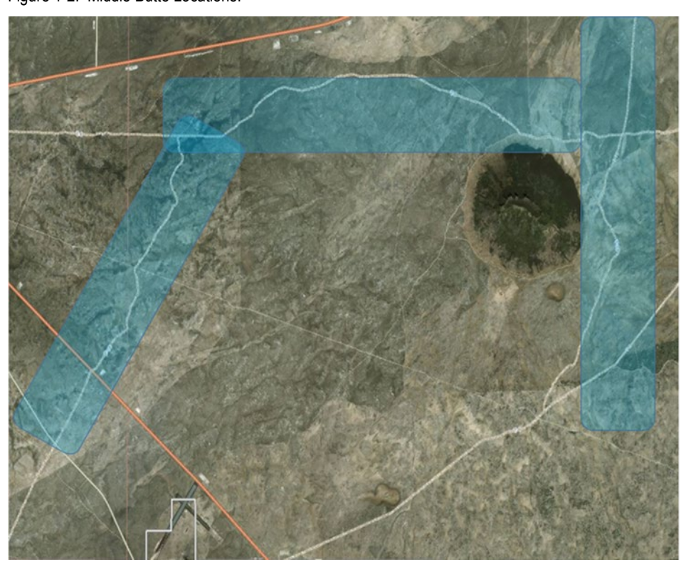
Figure 1-2. Middle Butte Locations.

The second area is located near Middle Butte. The testing will utilize the T-roads surrounding Middle Butte. The T-roads involved are T-4, T-6 or T-19. The transmitter will use a deployable 25-ft tall mast that use the transport vehicle as a counterweight. A 3 KW portable generator, in the bed of the truck, will provide power. The corresponding receiver will be an antenna buried in the ground just off the T-road. The area of disturbance is approximately 0.5 ft2 and approximately 6 inches deep. The distance between the transmitter and receiver will be varied between 0.5 to 1.5 miles. See Figure 1-2 for detail on the potential locations.