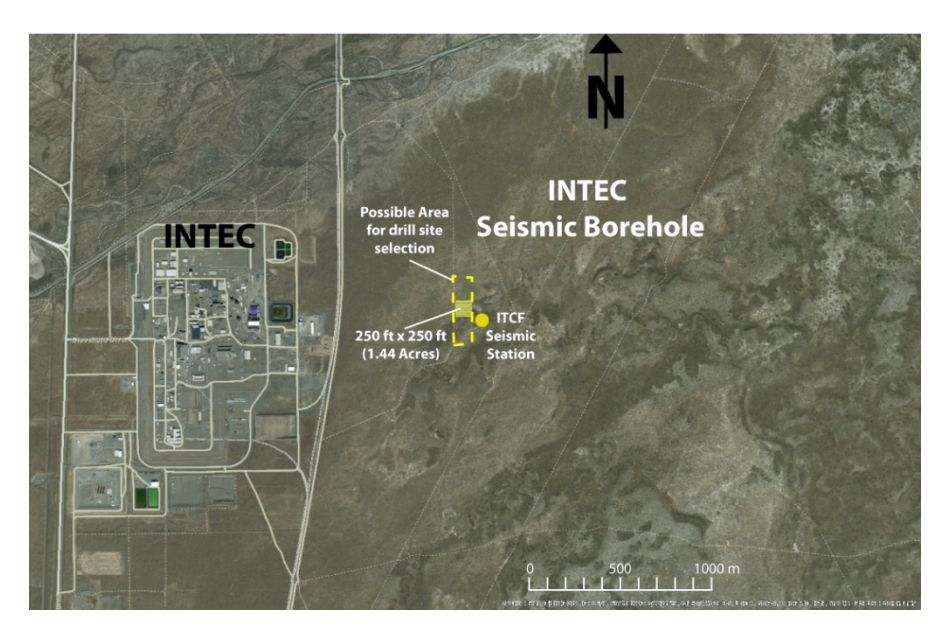
Figure 4. Map showing INTEC seismic borehole location with possible area (dashed yellow line) for selecting the 250 ft x 250 ft drill site (yellow box).