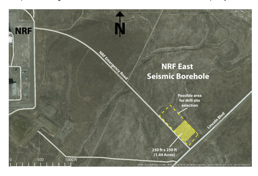
Figure 1. Map showing NRF East seismic borehole location with possible area (dashed yellow line) for selecting the 250 ft x 250 ft drill site (yellow box).

The NRF East borehole drill site is located off of Lincoln Blvd on the NRF emergency road (Figure 1), and has been reviewed and cleared for use as part of the Naval Spent Fuel Handling (NSFH) Facility. The NRF West borehole location is located west of an historic canal and has not been assessed (Figure 2). Drilling at the NRF West borehole includes placing a hose that connects to a refillable water tank along the road on the east side of the historic canal to avoid disturbance to the historic canal from water trucks crossing the canal to the drill site. Also, alternate roads around the historic canal will be used to transport the drill rig to and from the borehole location. The area for the temporary water tank and truck turnaround covers about 50 ft by 50 ft.