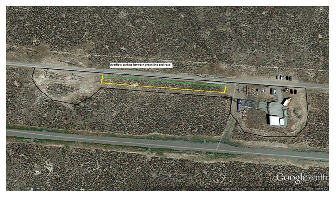
Figure 2. Additional area with unrestricted vehicle access

Vehicle access to these locations has the potential to impact sagebrush. To maintain Department of Energy's (DOE's) goal to achieve no net loss of sagebrush on the Idaho National Laboratory (INL) Site identified in the Candidate Conservation Agreement for Sagegrouse on the INL Site (CCA), the project must compensate for the lost sagebrush. The project must re-establish sagebrush in acreages equal to or greater than acreages lost by project activities. Re-establishment must occur within the restoration priority areas identified in the CCA. Restoration activities may be coordinated with other sagebrush restoration activities currently being conducted on the INL Site.