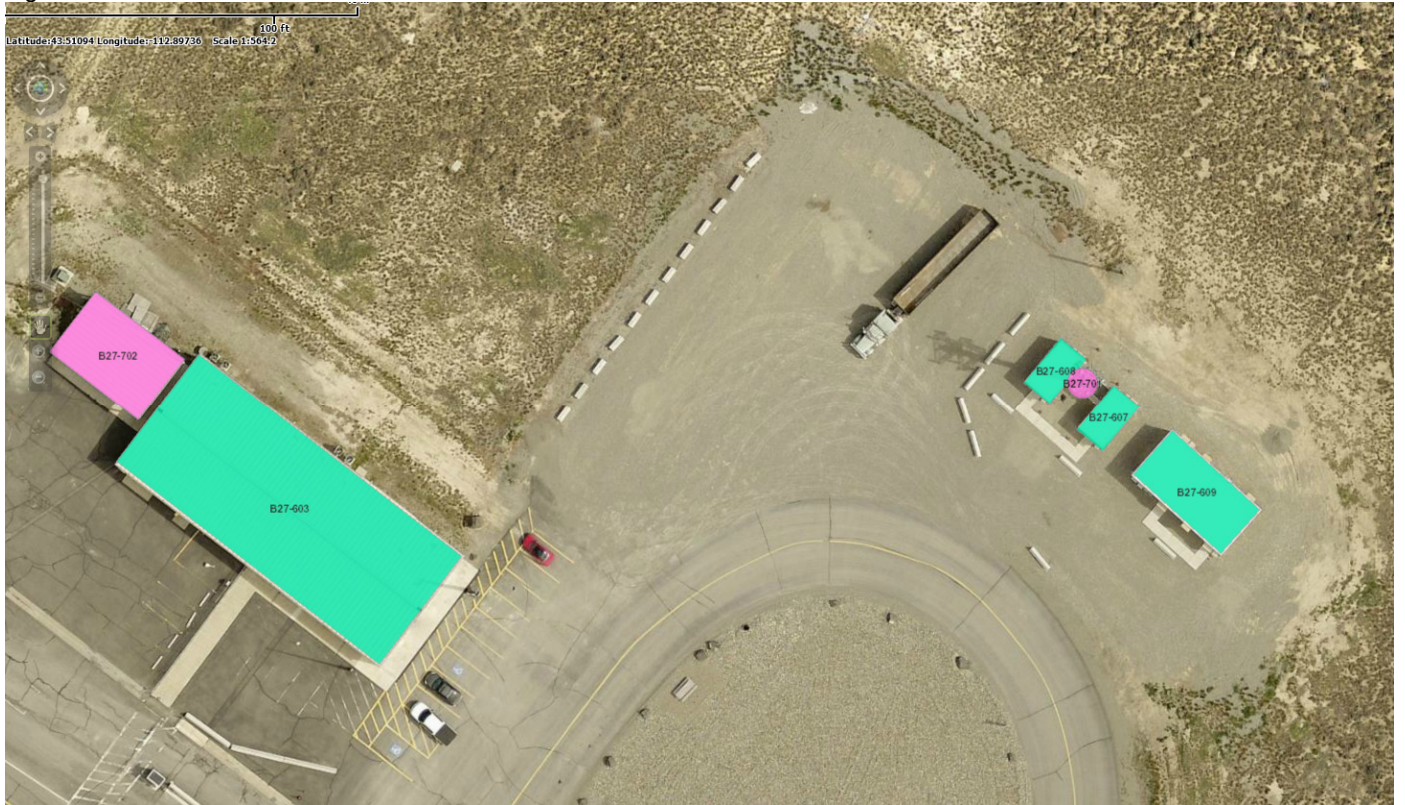
Figure 1 - General Work Area

The general location of the work is near the badging building at Gate 1, as shown in Figure 1