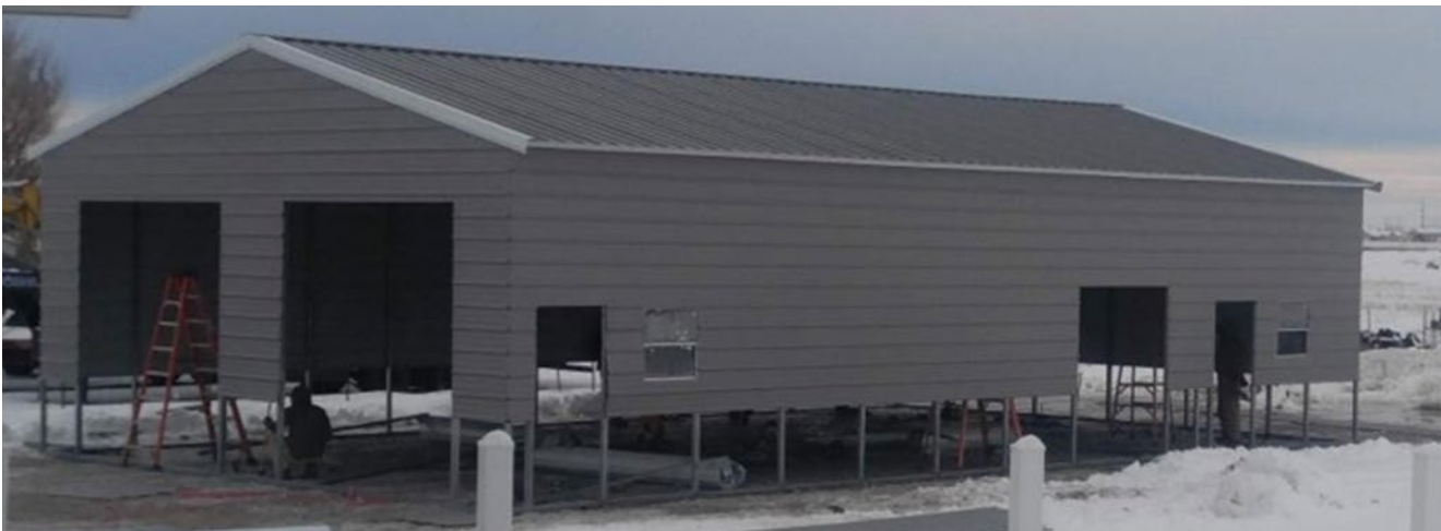
Figure 2-3. Example of the Steel Structure