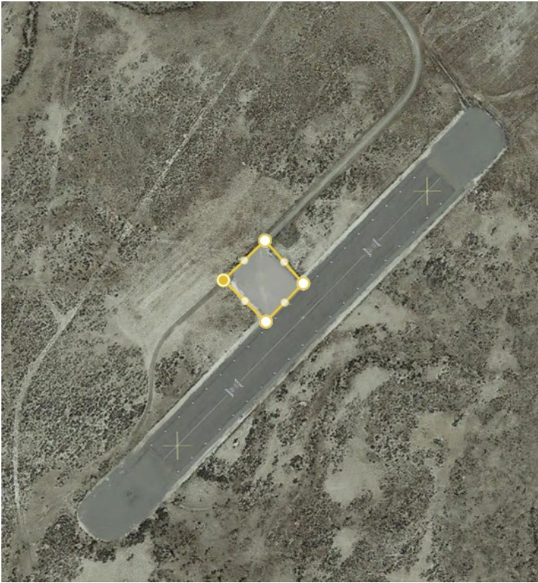
Figure 3-2. Proposed Location to be Paved with Asphalt