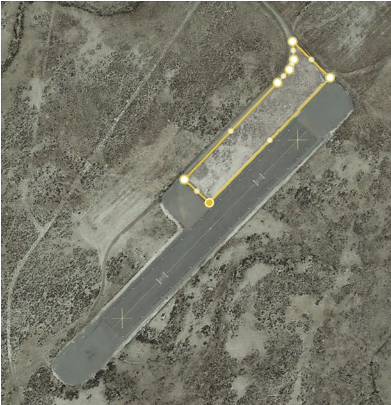
Figure 3-1. Proposed Location of Large Gravel Area

To pave the central gravel pad, a minimum of 3" of asphalt will be placed around B16-612 UAV Metal Shelter on top of existing crushed gravel. The area to be paved is approximately 17,000 square feet minus the footprint of the metal shelter (1500 sq ft). See Figure 3-2 for the proposed location of the area to be paved.