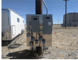
SIMILAR INSTALLATION AT PAD D FOR REFERENCE

SCOPE: EXTEND MEDIUM VOLTAGE POWER LINES TO THE UAV RUNWAY. NEW POLES WILL BE SET APPROXIMATELY AS SHOWN IN THE AREA LOCATION PLAN ON THIS SHEET. A POLE MOUNTED TRANSFORMER WILL BE PROVIDED TO FEED NEW ELECTRICAL EQUIPMENT MOUNTED TO AN ALUMINUM BACK BOARD INSTALLED ON THE FINAL POWER POLE. INSTALLATION DETAILS ARE SHOWN ON SHEET 2 AND WILL LOOK SIMILAR TO THE INSTALLATION AT PAD D SHOWN, PHOTO INCLUDED FOR REFERENCE.