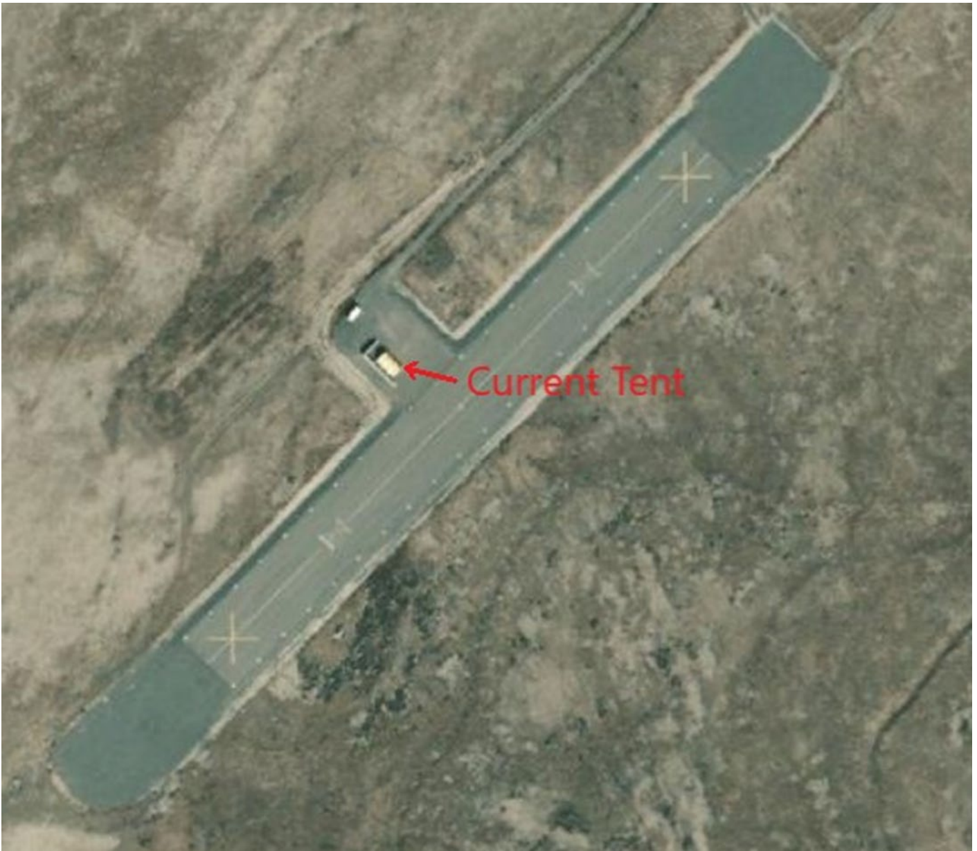
Figure 2-2. Current Location of the Tent at UAS Runway