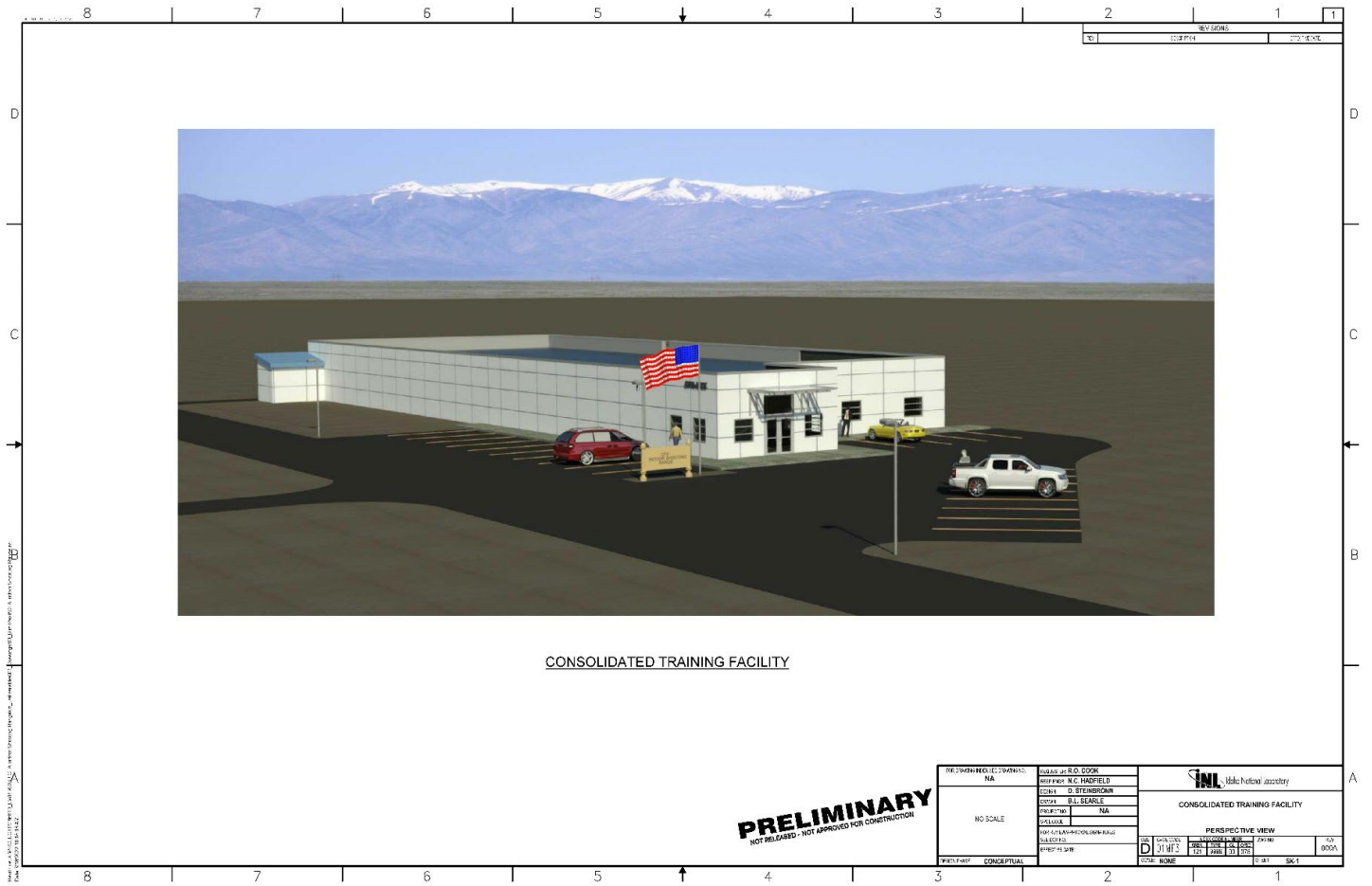
Figure 2. Three-dimensional Conceptual Design