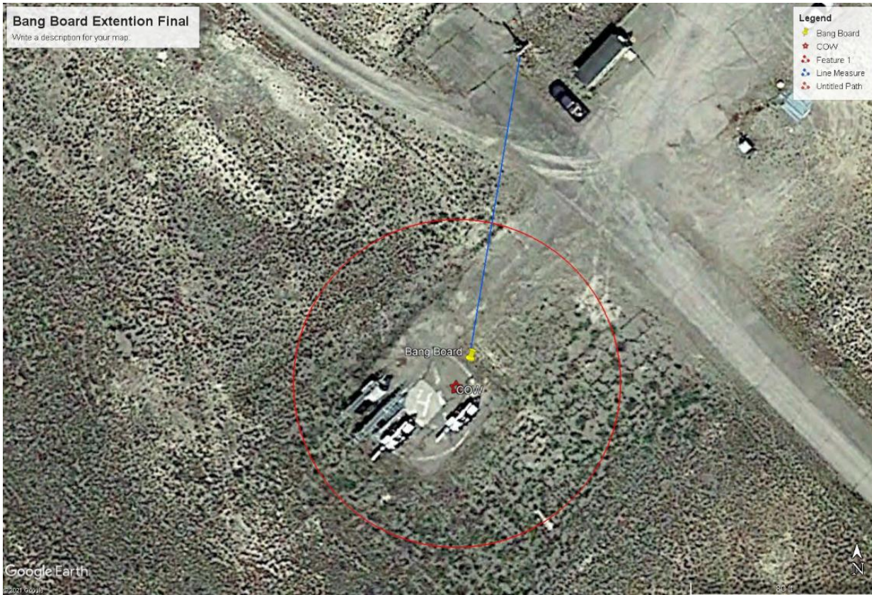
Figure 2 - 5G Network Required Facility Mods to Deploy 5G COW at INL STF