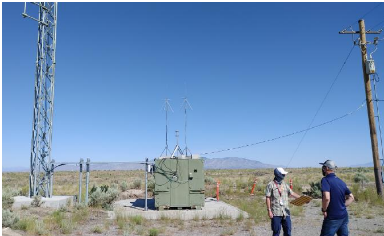
Figure 3 - 5G Network Required Facility Mods at INL Cell Site #9