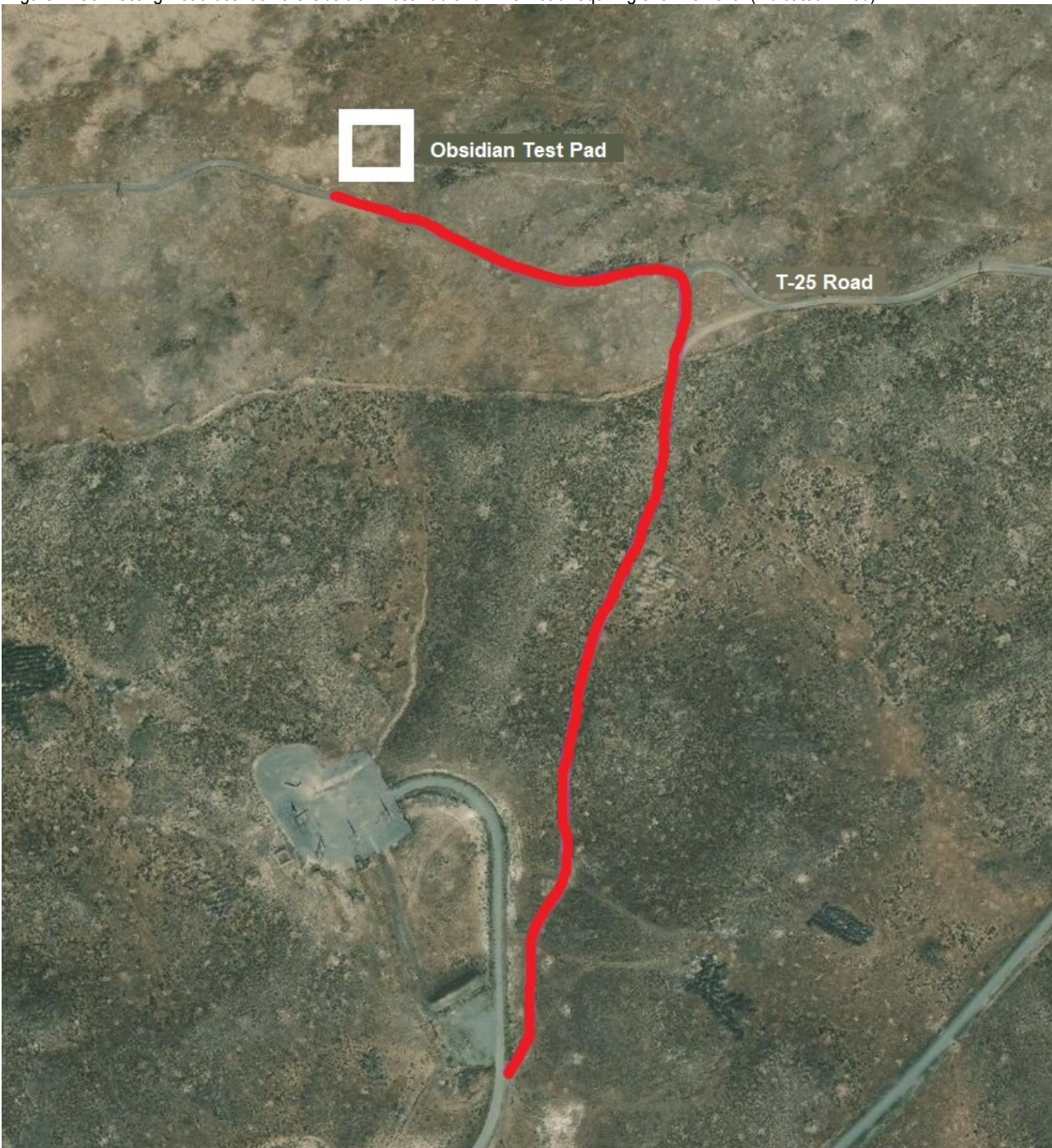
Figure 1. Connecting Road between the Obsidian Test Pad and T-25 Road requiring snow removal (indicated in red).

In order to adequately cover the activity of snow removal, 10 CFR 1021 Appendix B1.31, "Routine maintenance" was added as a NEPA reference.