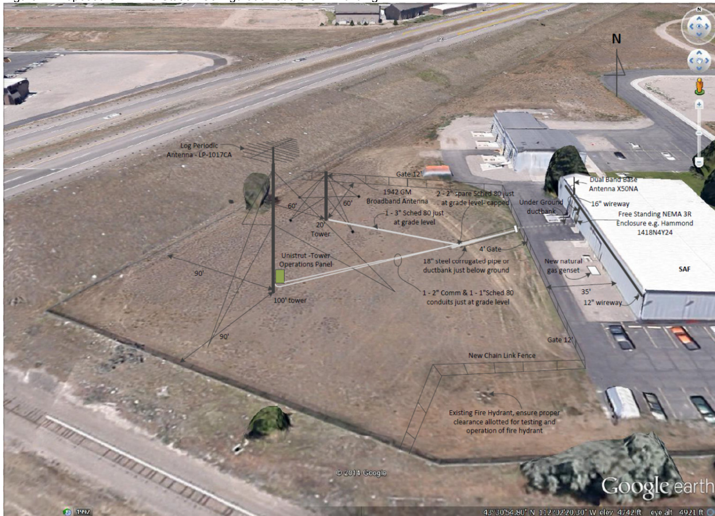
Figure 2. Proposed SHARES Station Configuration at the SAF Building

Construction is estimated to begin in November 2014 and end in February-April 2015 (weather dependent). The estimated cost for the new HF SHARES station is approximately $800,000.