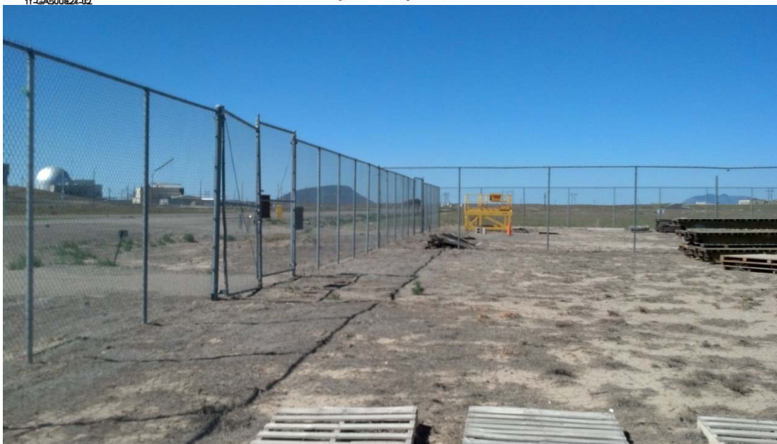
Figure 1. Location of ISC staging area

This work will involve clearing and leveling approximately 20,000 square feet of soil in a previously disturbed area north of the existing RSWF Staging Area at the Materials and Fuels Complex (MFC). This will entail the removal of 6 inches of existing pit run/soil sub-base and grade to match existing surface. Once the existing materials have been removed, subcontractor would replace with 3 inches to 6