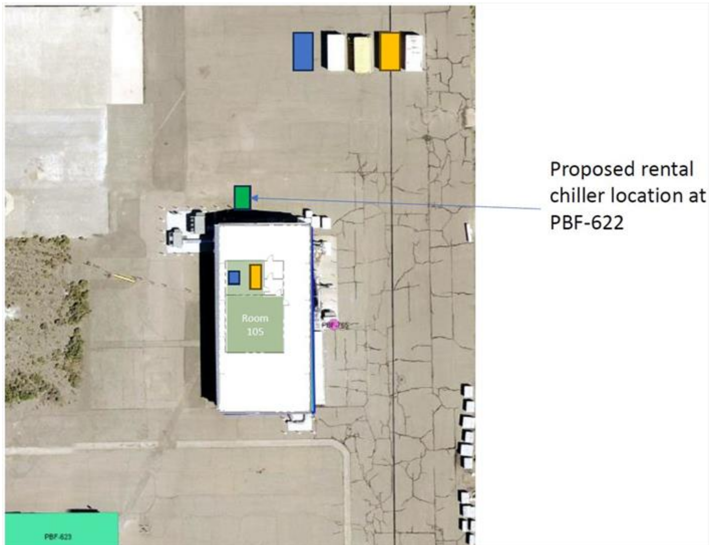
Figure 1, Rev 3: Location of chiller.

The temporary rental equipment is necessary to complete the test until the new chiller system (refer to Rev 1 Section below) is permanently installed. The temporary equipment will be located on existing blacktop as noted in Figure 1, Rev 3. The chiller supplies cold water to the existing research process and equipment inside PBF-622 to allow operations to occur. The equipment is estimated to be on-site for one month to be utilized during the one week test event.