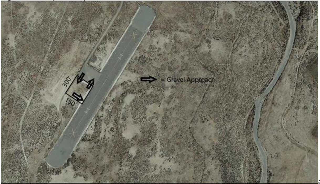
Figure 1-1: Proposed expansion are

Heavy equipment operators will remove vegetation from a 150' x 300' bare earth area adjacent to the air strip, and transport, place, level, and compact 12" (45,000 cubic feet) of pit run gravel. The project will also construct three (3) gravel approaches to egress the new area and the air strip.