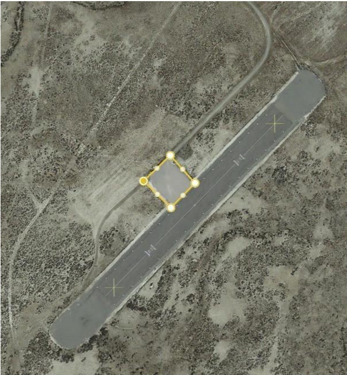
Figure 3-2: Proposed location to be paved with asphalt