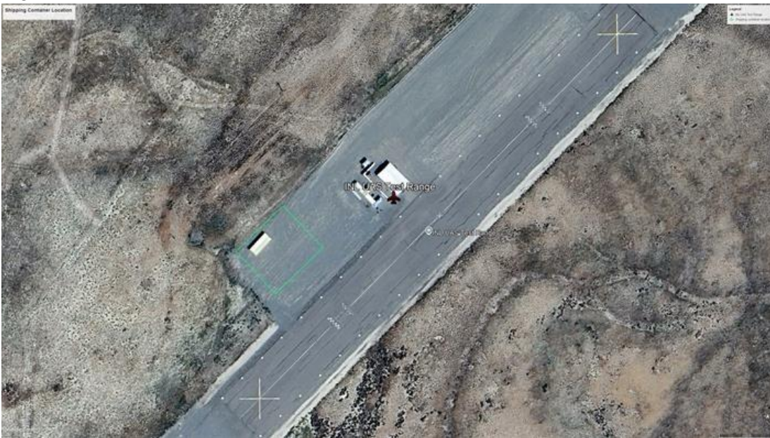
Figure 5-1: Conex Location

This revision includes the purchase and placement of seven conex storage containers at the UAS testing pad (Figure 5-1). The conex containers are 40 feet long, single stacked, and will be located on the southwest side of the gravel pad and place on railroad ties (four railroad ties per container). The conex containers will be utilized to provide storage for five RQ-21 Unmanned Systems and their support equipment in a location that will make it easy to use for flights in the near future. INL is planning to use the storage containers for approximately two years, at which point, the customer will inform INL of the next step for the RQ-21 UAS. No waste will be associated with this project nor any off-site work.