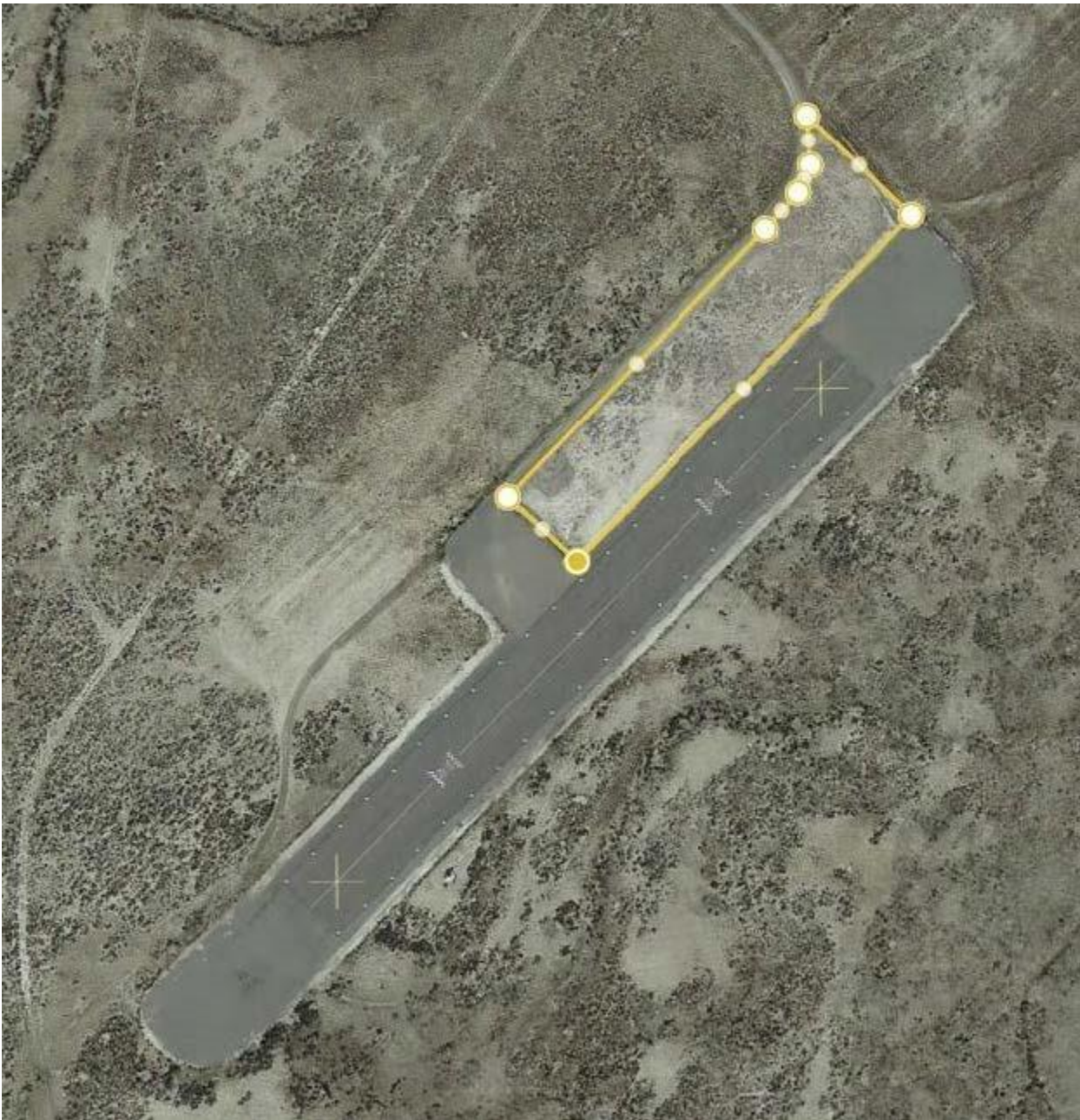
Figure 3-1: Proposed location of large gravel area

To pave the central gravel pad, a minimum of 3" of asphalt will be placed around B16-612 UAV Metal Shelter on top of existing crushed gravel. The area to be paved is approximately 17,000 square feet minus the footprint of the metal shelter (1500 sq ft). See Figure 3-2 for the proposed location of the area to be paved.