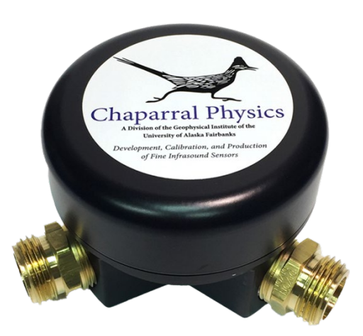
Figure 4. Chaparral infrasound sensor. This instrument will be used to measure the pressure wave from the blasts.

Figure 3. Nanometrics Centaur digitizer. This will digitize the data from the instruments and transmit the data via a 2.4 GHz radio.