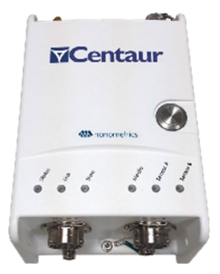
Figure 3. Nanometrics Centaur digitizer. This will digitize the data from the instruments and transmit the data via a 2.4 GHz radio.