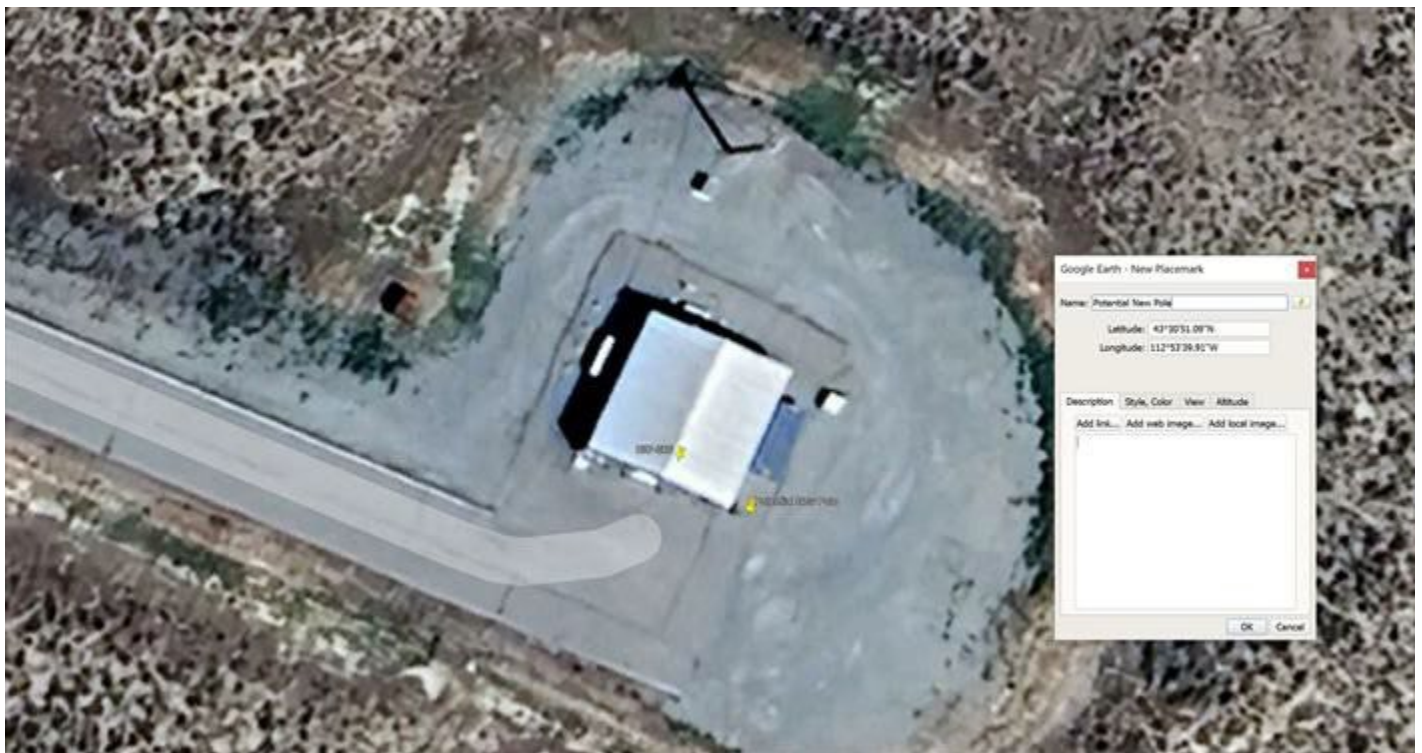
Figure 1, Rev. 2: B27-606 pole location

The project may also include the installation of permanent poles at Building B27-606 parking lot (Figure 1) and Trailer 6 (Figure 2) if testing event is successful.