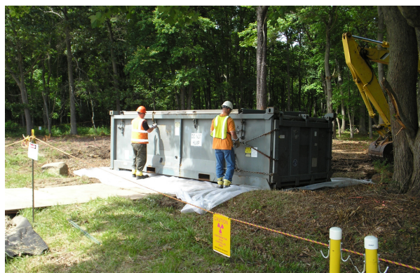
(Above) Soil Excavation and Waste Packaging in Progress