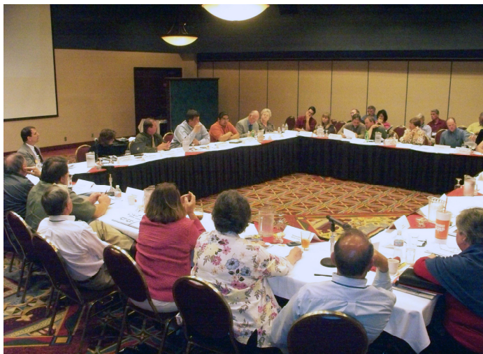
(Above) The impact of the Recovery Act on local communities was a key topic at the meeting of the National Conference of State Legislatures in Richland, WA. Twenty-four lawmakers from six states attended the meeting.