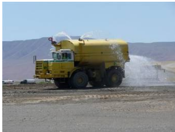
(Right) An order was placed in June for another water truck, similar to the one pictured, to help control dust from increased traffic and waste disposal operations at the Environmental Restoration Disposal Facility.

Facility upgrades include expanding the container transfer area, rerouting roadways and traffic patterns, and building additional dump ramps. To support the effort, orders for new equipment placed in late June included a water truck, two bulldozers, 6 shuttle trucks and a new scale. The improvements will allow an increase in the facility's capacity to accommodate the increase in waste volumes from other Hanford contractors.