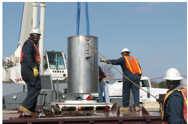
(Above) Workers moving shipping cask to transport trailer.

The HFBR was a research reactor that operated between 1965 and 1996. Used solely for scientific research, the reactor provided neutrons for experiments in materials science, chemistry, biology, and physics.