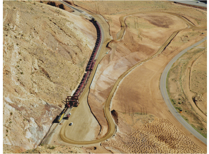
(Above) Aerial view looking north at 22 railcars on track at Moab Project site and the one-way haul road that crosses State Route 279 (in right center of photo).