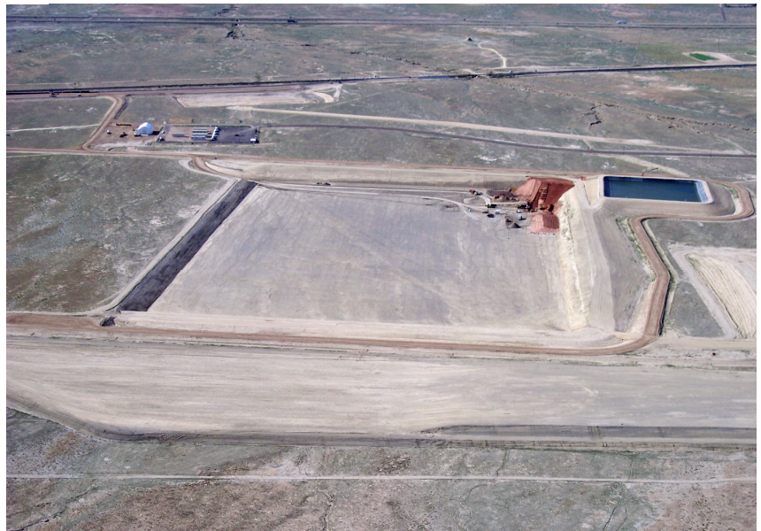
(Right) Closer view of excavated portion of the disposal cell looking south. Tailings placed in the cell as of June 2, 2009, appear as reddish color.

For more information on EM Recovery Act work, please visit http://www.em.doe.gov/emrecovery/ , http://www.recovery.gov/ , and https://recoveryclearinghouse.energy.gov/ . Feel free to send questions and comments to EMRecoveryActProgram@em.doe.gov . Your feedback is welcomed.