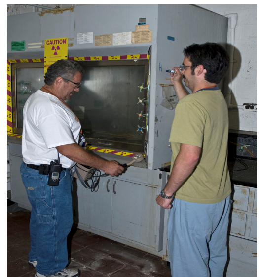
Radiological control technicians characterize Building 9735 for waste disposal. Four additional Y-12 facilities will be demolished with Recovery Act funding.

Additionally, project performance baselines, including resource-loaded schedules and project execution plans for both the initial 12-weeks and the full duration of the projects, have been submitted for approval. A subcontracting opportunity is under development for hazardous material abatement.