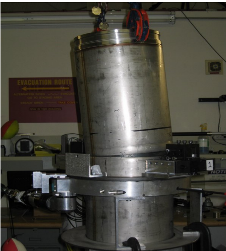
(Above) Innovative pipe cutting technology allows the Idaho Cleanup Project to access waste materials inside a HFEF-5 canister.

The Idaho Cleanup Project is taking on a new waste management challenge that creates new jobs and paves the way for future project opportunities. Remote Handled Transuranic waste processing operations began on May 14, 2009, when the first Hot Fuel Examination Facility (HFEF-5) canister was lowered into a shielded cell at DOE's Idaho Site. The outer and inner canister lids were removed, and the contents were repackaged into two 55-gallon drums for future characterization, transport, and disposal. This remote handled, multi-phased operation is another example of the Recovery Act cleanup work happening across the site and across the country.