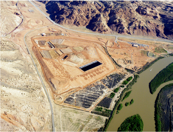
(Above) Aerial view of entire Moab Project site looking north. The rail line is in the upper left-hand corner and the Colorado River is along the right side. The tailings pile is in the center of the photo and the excavation and drying beds are in the northwest corner of the pile.

Below are photos of the Moab Uranium Mill Tailings Remedial Action (UMTRA) Project in Utah and the Crescent Junction disposal site associated with the project before implementation of the Recovery Act project. Expect to see additional photographs of the Recovery Act Work as it progresses in future issues.