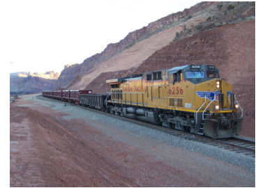
Mill tailings train

Recovery Act funds ($108 million) are being used to accelerate the frequency of uranium mill tailings shipments from the Moab Uranium Mill Tailings Remedial Action (UMTRA) Project site to a disposal site near Crescent Junction, Utah. Mill tailings are a byproduct of uranium mining and processing. Located northwest of Moab in Grand County, Utah, and on the west bank of the Colorado River, the Moab UMTRA Project includes the former Atlas uranium mill site that ceased operations in 1984. About 130 acres of the site is covered by a 16-million-ton uranium mill tailings pile. The mill tailings are being moved by train to the disposal site 30 miles away, where they are being safely and permanently disposed of in an engineered cell.