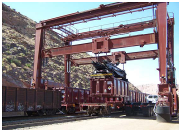
A gantry crane loads a container full of tailings onto a railcar