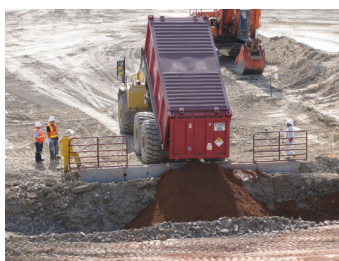
Dumping mill tailings in disposal cell

The Recovery Act funding shortens the estimated project completion date from 2028 by several years, and with efficiencies, DOE hopes to further accelerate the completion date.